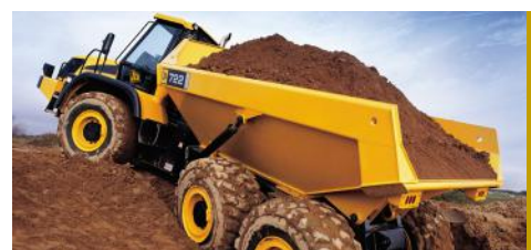
CONSTRUCTION & QUARRYING