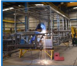
WELDING & FABRICATION