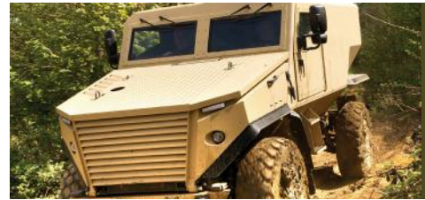
DEFENCE & SECURITY